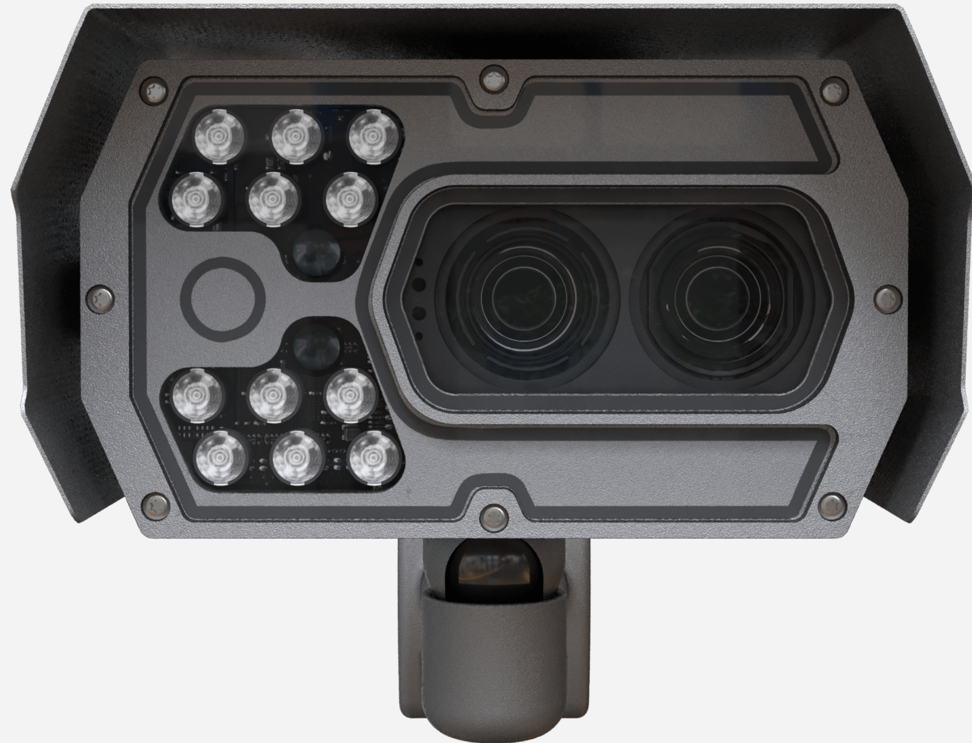
Image-Based Axle Counting with a Single, Intelligent Camera

Vidar Axle Counter is a compact yet robust camera designed explicitly for axle identification and counting. The camera provides side scan images with metadata containing axle count and vehicle category for road tolling, ferry access control, logistics and many other applications. Detection of vehicles is highly accurate thanks to the triggering being based on video analytics.